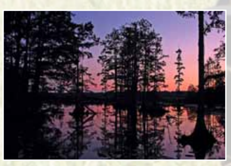
"We must tell our stories with the heart of a poet and the facts of a scientist as we engage Americans in the stewardship of our land."

Along with these environmental challenges, profound changes are taking place in the fabric of America. The population of the United States has increased more than 14 percent since 1998, and citizens are becoming increasingly concentrated in cities. By 2050, the U.S. population is projected to grow to almost 400 million. The country is also becoming more racially and ethnically diverse. Groups that have historically been considered minorities are projected