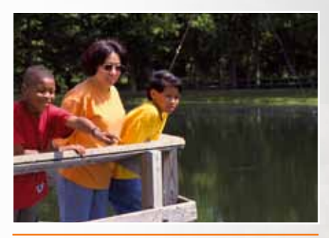
"Bring unconventional partners into our fabric of interest. Ultimately people might then care about wilderness."

We are also mindful that reaching citizens of diverse ethnicities involves connecting not just with urban areas, but also with rural communities. For example, many refuges in the South could develop an African-American constituency, while in other parts of the country, we could