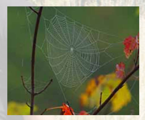
"It's ambitious, it's inspirational, and more important, it's doable."

Despite the challenges, there are many opportunities. The number and variety of people, organizations and agencies that took time to comment on this vision