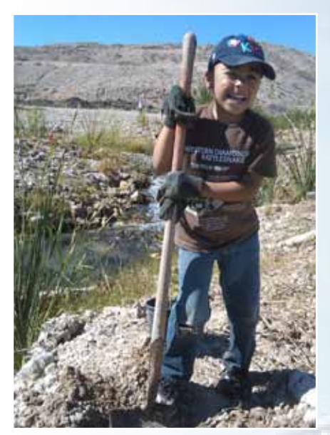
"The challenge lies before us—to be the conservation leaders that are needed today and to create conservation leaders of tomorrow."

of the circumstances in which they find themselves. This inner focus, self-awareness and confidence drives leaders to accept increasingly greater challenges.