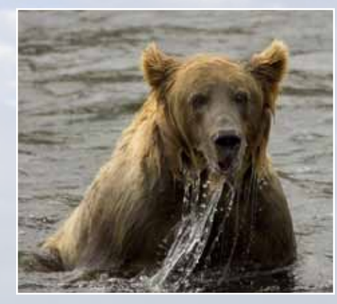
"Our level of scientific accountability must be higher in these times of increased expectations...all employees, not just biologists, must be well-versed in science."

While we acknowledge the challenges, we recognize and affirm the primary role science plays in all of our work. Our commitment to scientific excellence permeates and transcends the Refuge System. We demonstrate this commitment by applying relevant science to all aspects of refuge management,