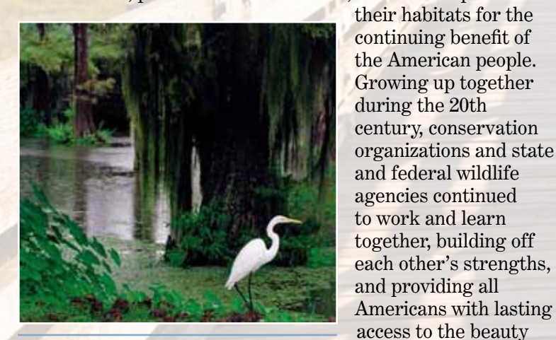
"Every one of us makes a difference every day. Everyone has a role to play.

non-game species, international conservation, wilderness areas and land protection. We recognize the fundamental role of conservation groups in helping to enact legislation that has led to healthier functioning ecosystems and increased biodiversity across North America. The Service is both a wildlife management and conservation agency, and refuges have been established for both purposes; migratory waterfowl production and endangered species protection. We will continue to work with hunters, anglers, state agencies, and conservation organizations that support consumptive and non-consumptive uses alike to conserve, protect and enhance fish, wildlife and plants and