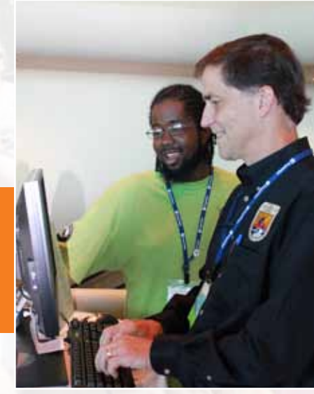
"Technology is the key to getting 'generation next' back outside."

We are all ambassadors for the Service and the Refuge System. Employees need to be not only experts in their specialties, but familiar with the mission and goals of the System as a whole—and