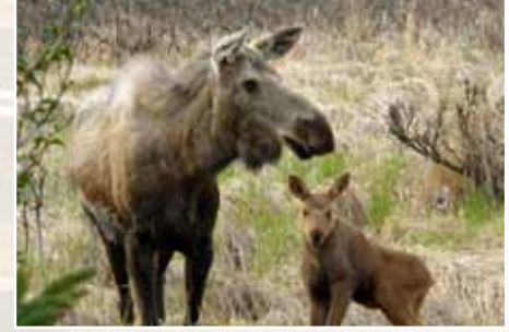
"Have the courage to think radically...what would you do if you weren't afraid?"

While the Refuge System's benefits to wildlife are measured in many ways, refuges play crucial roles in human communities, too. By protecting wetlands, grasslands, forests, wilderness and other natural habitats, refuges improve air